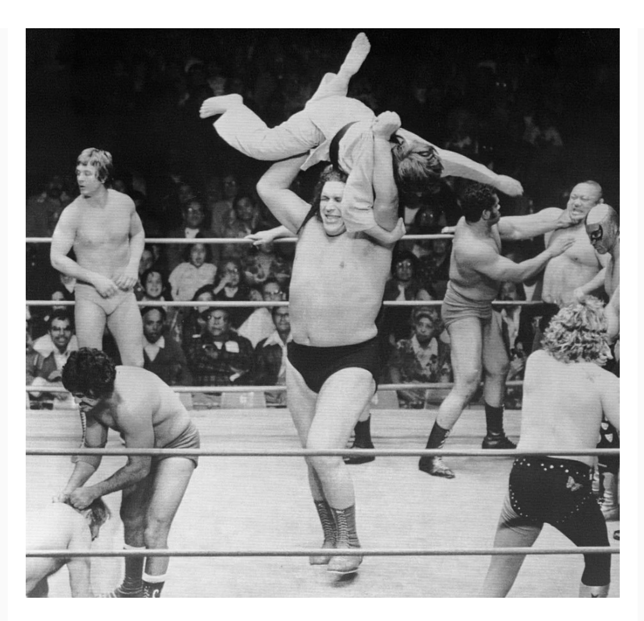
Let's start in Asia.

The Japanese yen hit a 24-year low vs. the dollar last week. The Yen vs. Dollar chart looks like an Acapulco cliff diver. The Japanese were so concerned a yen freefall was imminent, the Bank of Japan intervened in the foreign currency markets to support the currency. The Japanese had not intervened since the Asian financial crisis in 1997-98.